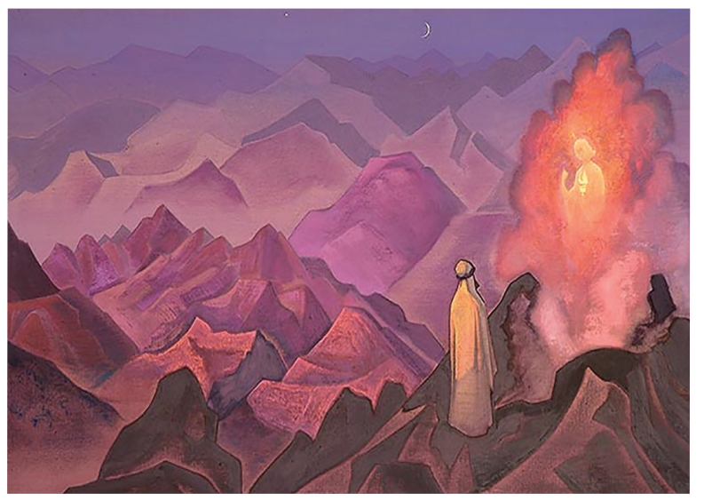
Mohammed the Prophet by Nicholas Roerich, 1932

Fiery World I, 106. The master smelter counseled the new worker on how to approach the fiery furnace. But the worker's only concern was to learn the chemical composition of the flame. The master said to him, "You will be burned alive before you reach the flame. Knowing the chemical formula will not save you. Let me give you the proper clothes, change your footwear, shield