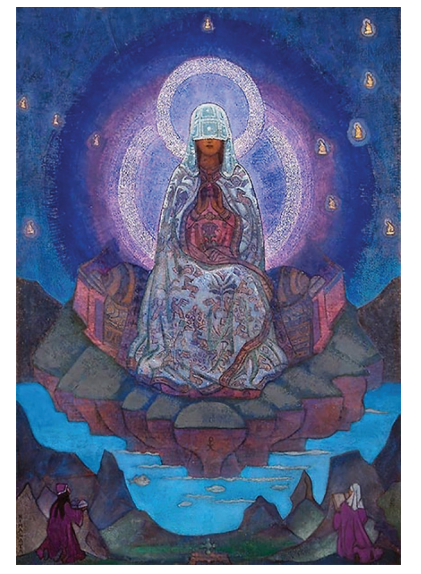
Mother of the World by Nicholas Roerich, 1924