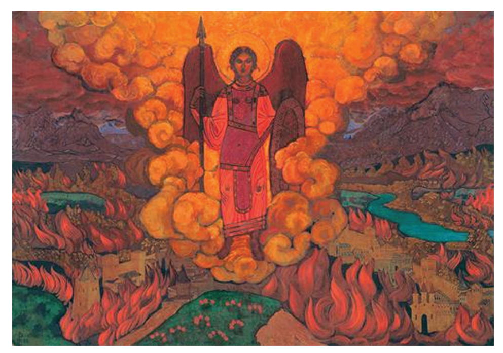
The Last Angel by Nicholas Roerich, 1912

Heart, 167. When you place the point of a pendulum above a sandy surface in order to watch the cosmic vibrations, you will not push the needle by hand in order to forcibly accelerate its motion. Such forcing first of all would be stupid, because it would only produce a false indication—the same with the pendulum of the spirit, one cannot force its indications. The designs of the needle of the spirit are complex, and only the striving of the heart can vitally and truthfully strengthen the indications of the pendulum. The Teaching of ancient Tibet speaks about the same