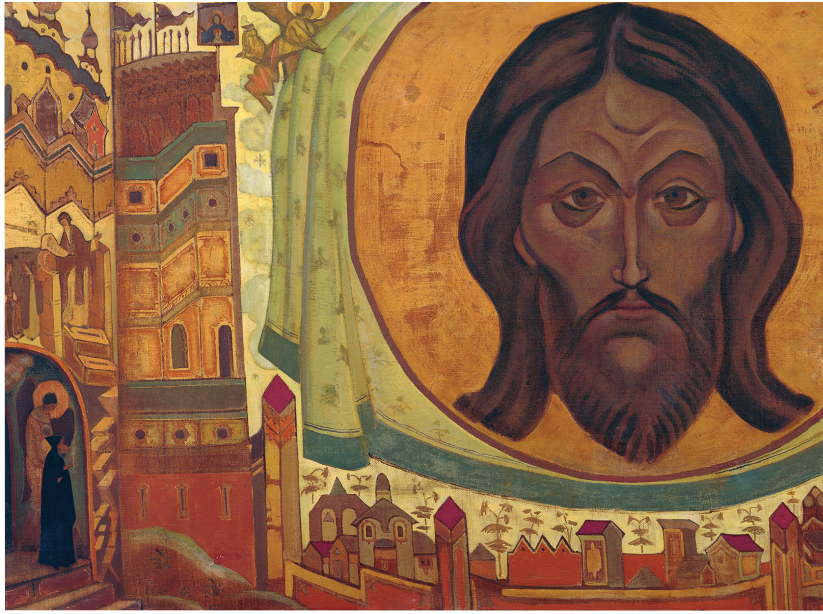
And We See by Nicholas Roerich, 1922

himself wholly to the achievement of drinking the cup of poison? Who will take upon himself the Fiery Shield for the good of humanity?... Who will resolve to accept the fiery energies? Who will manifest the understanding of the entire Cosmic tension? Verily, he who is in consonance with the Higher Forces. Mankind is accustomed to demand Good, but very