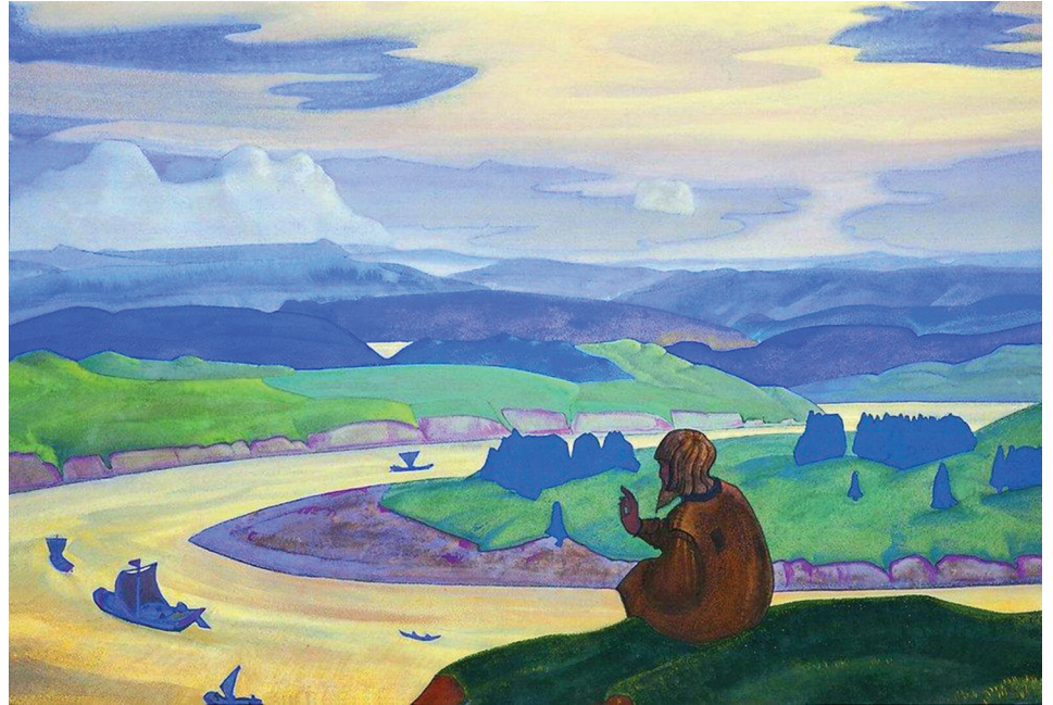
Procopius the Righteous Praying for the Unknown Travelers by Nicholas Roerich, 1914

Fiery World I, 433. An indefatigable spirit is needed to advance along a constant progression. Only such expansion and containment will bring real tolerance toward anything that is futile, this is learned through relativism. Thus, say to him who has doubts about the Teach-