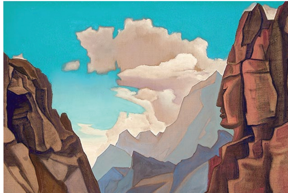
Great Spirit of the Himalayas by Nicholas Roerich, 1934

Aum , 469. Nothing can be achieved all at once. Long ago it was said that in a single sigh we overcome space, but it is necessary to know how to sigh. It would seem that in a single sigh is expressed the essential nature of psychic energy, but not at once does this correlation impress itself upon one's consciousness. The primitive imagination with extreme ease constructs a Maya of all sorts of visions, but when