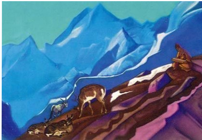
Book of Life by Nicholas Roerich, 1939

Infinity I , 69. The basis of being will be inscribed into the Book of Life, and when the consciousness will reach the level of realization of eternal unity, then will it be possible to tell humanity, "Construct your life upon the principle of unity." How many spirits will be able to express themselves in the higher way?