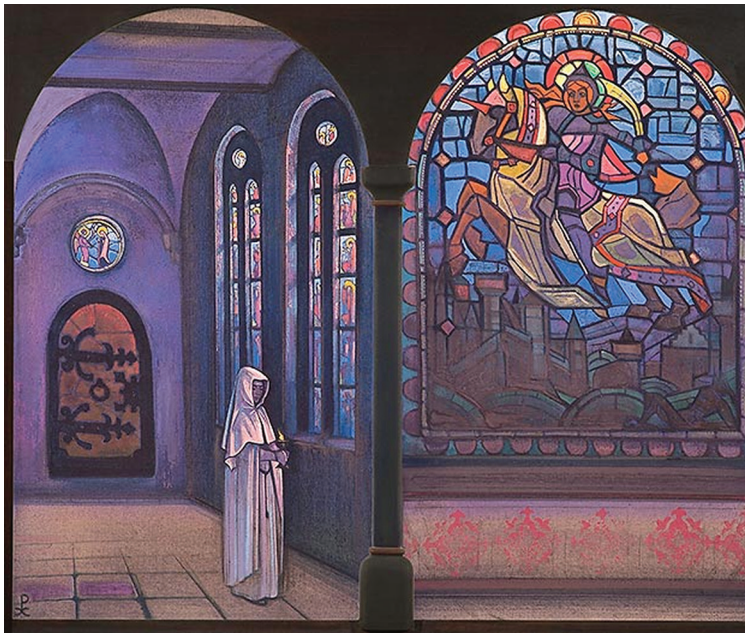
Glory to the Hero by Nicholas Roerich, 1933

Agni Yoga, 603. Notice that a deep sigh accompanies any application of psychic energy. Does not this indicate that this energy is something tangible? Point out