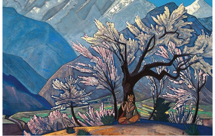
Krishna by Nicholas Roerich, 1929

Heart , 201. In ten years the blows of fate will force one to venerate the Book