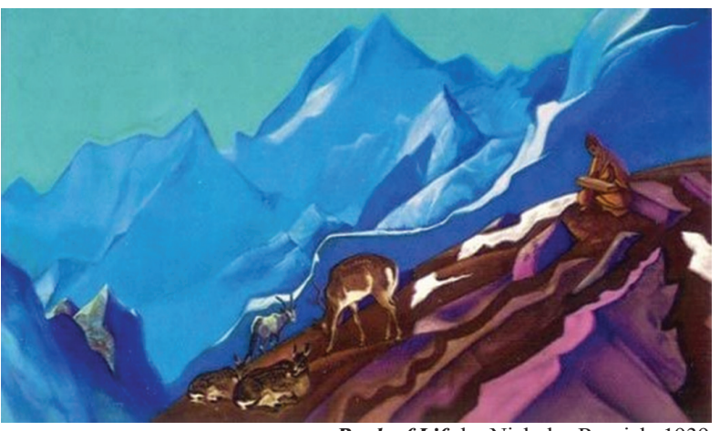
Book of Life by Nicholas Roerich, 1939

"The densifying of the subtle body can give that of which the Teaching of