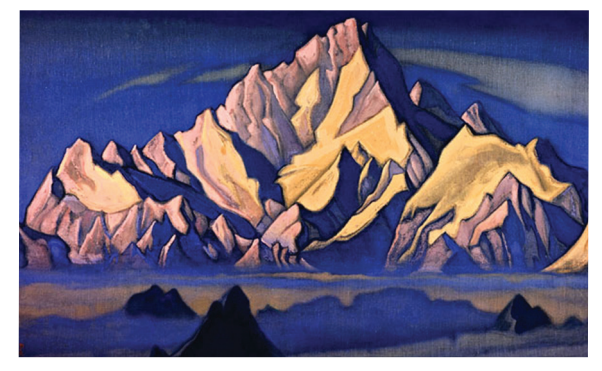
Abode of King Gesar by Nicholas Roerich, 1947

"When We say, 'Know,' We are insisting upon a