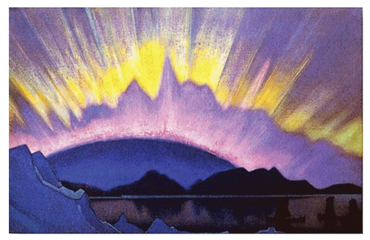
Northern Midnight by Nicholas Roerich, 1940

Towers alerts the centers." ( Infinity II , verse 324)