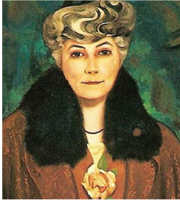
Helena Roerich by Svetoslav Roerich, 1937

Hence, each of Ur.'s centers is so sensitive to catastrophes. Hence the heart absorbs all energies as in a spatial funnel, feeling each vibration. Therefore the sunlike heart helps in the purification of space. The impetuous heart goes to meet each fiery energy half-way. Such impetuosity is possible only through fiery self-activity, which is attained on a highest step of fiery transmutation. Therefore each cosmic vibration is felt so sharply. When We indicate earthquakes, one should not always expect external manifestations. One must first of all bear in mind those tremors which take place in the depths. Therefore those pangs, which are felt so deeply by the centers, have a relationship to the depths