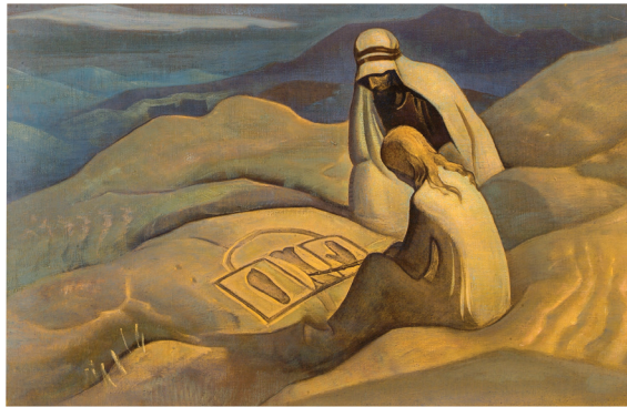
Signs of Christ by Nicholas Roerich, 1924

On a white camel We set out by night. And by night-crossing We reached Lahore where We found a follower of Buddha, ap-