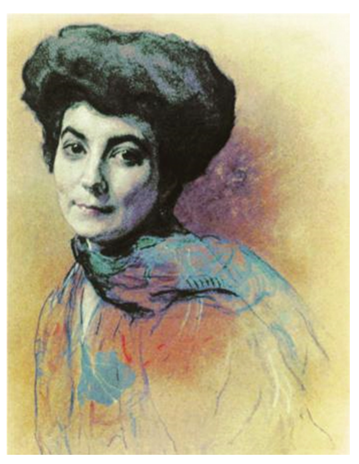
Helena Roerich by Valentin Serov, 1909

It is necessary to realize the difficulty of discerning the different currents.