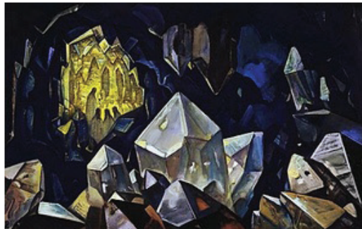
The Most Sacred by Nicholas Roerich, 1933

4. Perhaps Brotherhood does exist? Perhaps, as an earthly anchor, it maintains equilibrium? Perhaps in the dreams of humanity it has remained as an unalterable reality? Let us recall certain dreams and visions, so