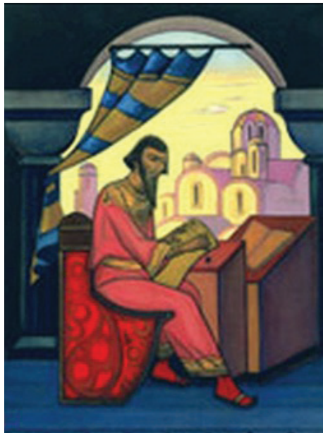
Yaroslav the Wise by Nicholas Roerich, 1941

Brotherhood , 18. On the paths to Brotherhood self-renunciation also will be