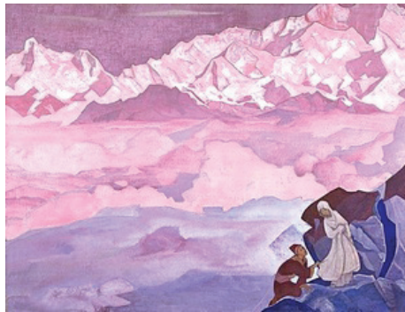
She Who Leads by Nicholas Roerich, 1934