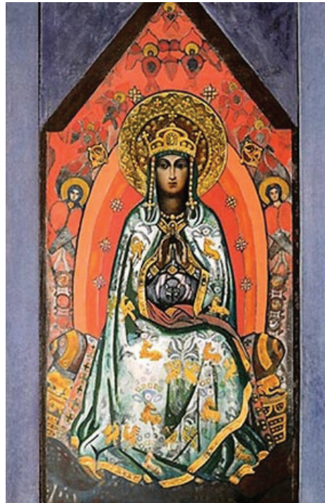
Queen of Heaven by Nicholas Roerich, 1931

102. In contrast with confidence there is depression. Precisely distrust begets this awful viper. But trust awakens the most fiery, the most divine instincts of the spirit. Beings of the Fiery World can approach people in hours of trust, and the miracle of enthusiasm creates the most beautiful approaches.