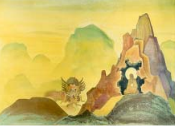
Arhat by Nicholas Roerich

If one wants to create a strong foundation, the best building materials are the seven Principles of Beauty, Goodness, Truth, Joy, Freedom, Striving and Sacrificial Service. Each of these Principles have their inherent qualities such as balance, right motive, humility, obedience, etc. Operating with the Principles are the Laws of God. Just as all is contained within the Creator's universe, so is all contained within a strong foundation. Thus even in everyday life, the physical, emotional, and mental choices we make throughout the day and night affect the soundness of our foundation. Vices, vanities, illusions and glamors make for a very weak foundation, and when a foundation such as this is tested, it will fail a person. In our day-to-day, hour-by-hour mundane lives, we are at any moment, through our thoughts, emotions, and actions, build-