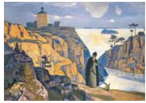
Holy Lake by Nicholas Roerich

As to how to apply one's qualities in Service, it is not enough to say, "I have come and I wish to serve," for readiness to serve obliges the disciple to acquire discipline of spirit. It is insufficient to say that all indications of the Teaching have been accepted, for only in life is it possible to manifest acceptance of the Indications. If the earthly plane imposes hard and fast rules, the world