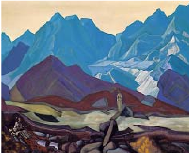
From Beyond by Nicholas Roerich

Labor is the striving to transform ourselves and others. If all could realize this, it would transform the actions that people take in this world as well as the labor they do. If children could learn this, they would see that no effort is pointless or valueless. Evolution is unconscious progress. Better evolution is conscious labor to evolve. We should not measure our days in money but see labor as the transformation into gold. Labor is the work to manifest the vision, and within our labor, there must be striving.