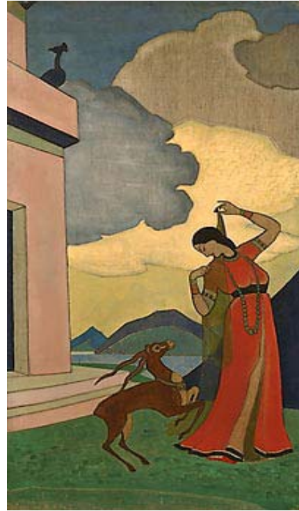
Song of Morning by Nicholas Roerich