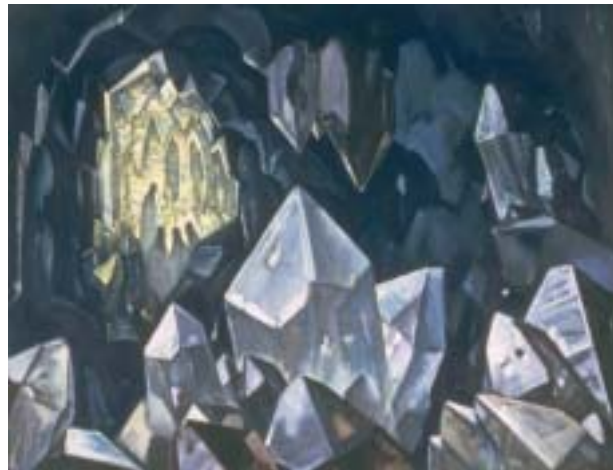
The Treasure of the Mountain by Nicholas Roerich

We know that virtues increase our magnetism. Every virtue adds to our magnetism. “Each one of us can change into a magnet and increase goodness on earth through developing virtues. People will