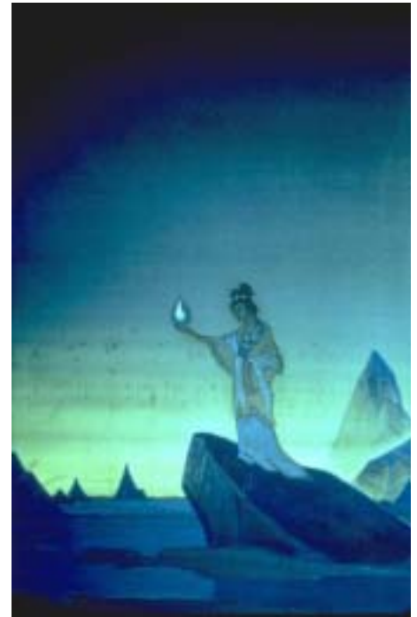
Agni Yoga by Nicholas Roerich

If you do not have heart, you can have no contact with the Higher spheres, which is